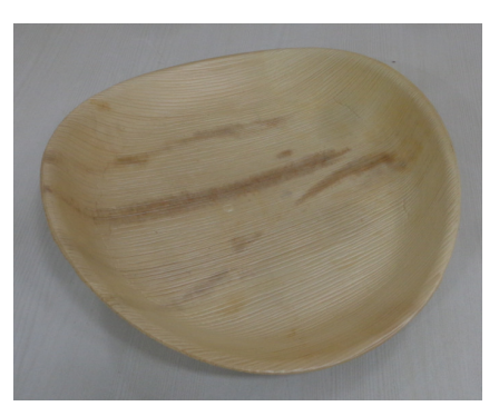
Microwave tested sample